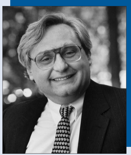
Honorable Alex Kozinski

United States Court of Appeals for the Seventh Circuit