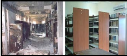
Before After 3/15/05